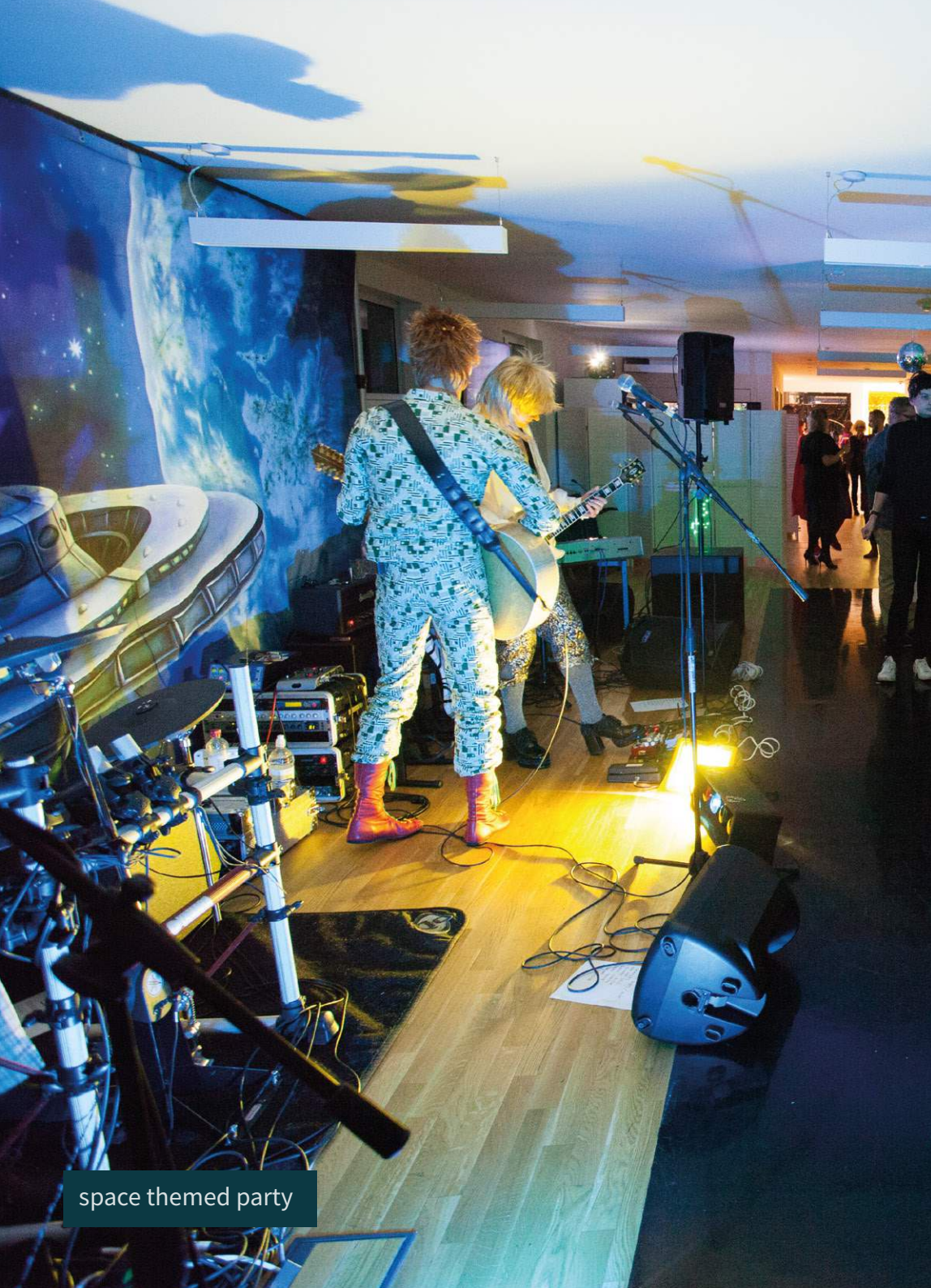
space themed party